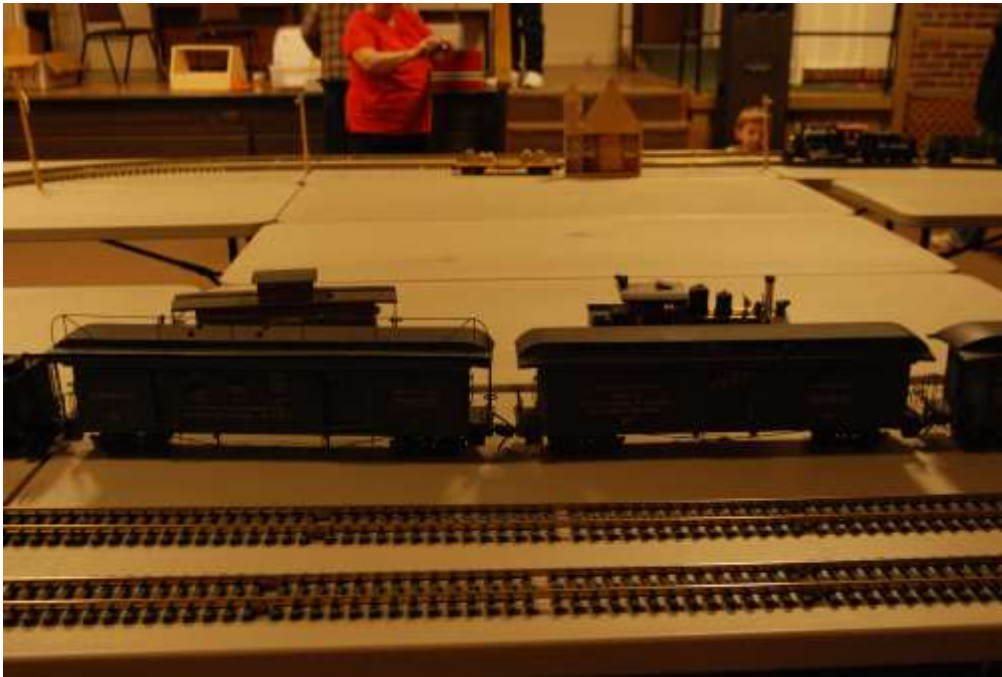
Scratch Built cars by Howard Hoy