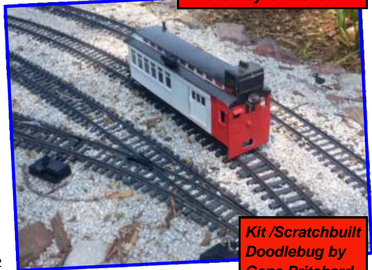
Kit /Scratchbuilt Doodlebug by Gene Pritchard